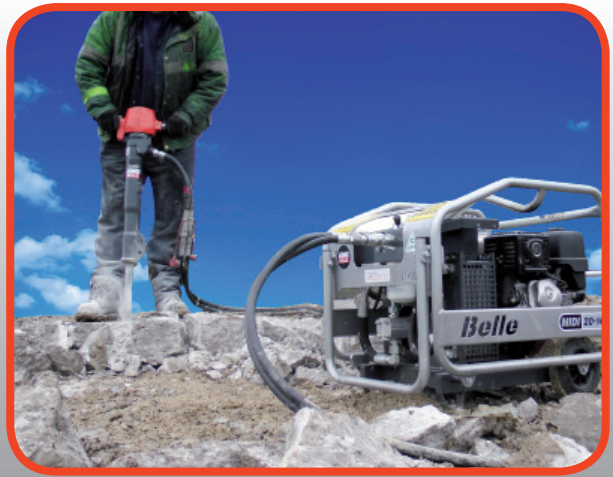
Compatible with Altrad Belle HPP Power Packs