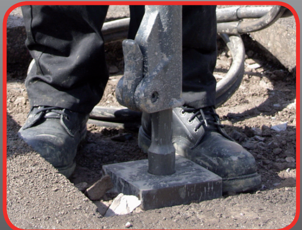
Range of Steels available including a Rammer Steel Option.